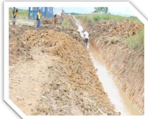
Drainage Works at Yambi Station. This is in preparation for the Development of Wosera Gawi District Head Quarters