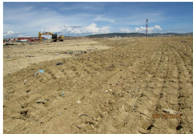
Landfill Cap Construction Works, PNG LNG