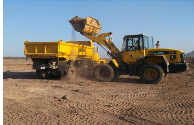
Site preparation including bulk earthworks for Housing Development at Gerehu Heights

We are committed to understanding the changing needs of our clients and our business will evolve to ensure we continue to satisfy their requirements. We work with our clients in an open and collaborative way and have a desire to prove that we can provide the service and the best finished product at a competitive price.