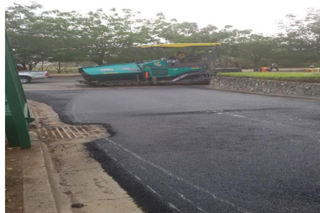
Laying of Asphalt Overlay at Parliament